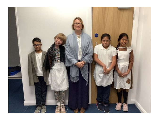
Our Year 6 children enjoyed taking part in Victorian Day with their mainstream classes. They definitely prefer school now rather than in Victorian times.